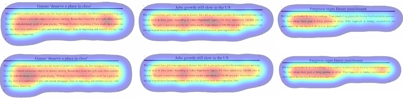
Figure 2: Three examples of our heatmap generation (top: ground truth, bottom: generated). The model for the heatmap generation was trained in a document-independent manner.